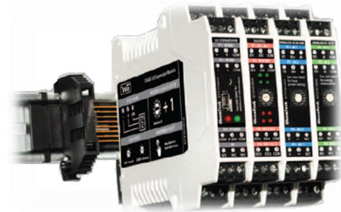
Modbus® RS485 Master Device (PLC / RTU / HMI / DCS / SCADA / Radio)

The Modbus RS485 I/O System provides an easy and cost-effective way to connect local digital and analog devices to any Modbus master, such as SCADA systems or PLCs. This system requires no configuration or network mapping, as each I/O module appears as a slave device on the Modbus network with a pre-configured data map. I/O modules are conveniently powered from the Modbus RS485 module via the DIN rail mounted DataRail backplane. Up to 16 I/O modules can be added to one Modbus network, making it easy to add the devices you need. The system can also be used in conjunction with ProSoft Frequency Hopping radios for remote applications.